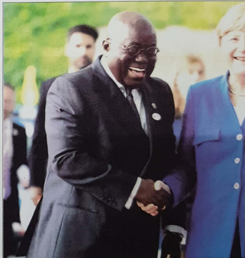
G20 Africa Conference: German Chancellor Angela Merkel welcomes the President of Ghana Nana Akufo-Addo to G20 Afrika Partnership Conference in Berlin - June 2017