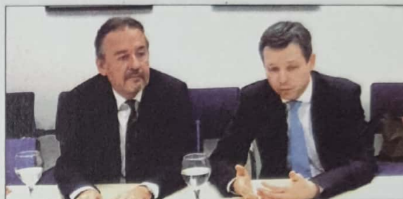
Visit Thomas Silberhorn: RVisit of German Deputy Minister for Economic Cooperation and Development, Thomas Silberhorn in Ghana. – March 2017