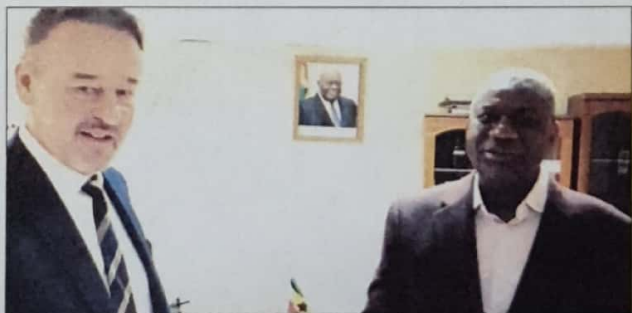
Reform partnership on Renewable Energy: Commitment between H.E. Christoph Retzlaff, Ambassador of the Federal Republic of Germany to Ghana and Mr. Boakye Agyarko, Minister for Energy. Renewal to intensify cooperation in the area of renewable energy in Ghana - March 2017