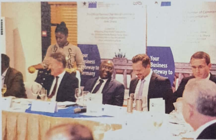
Business Lunch with Vice President Dr. Mahamudu Bawumia, German Ambassador Christoph Retzlaff and German enterprises, organized by KAS & AHK

The WACEE has grown significantly since its inception in 2012, and due to its scope of waste management and renewable energy as well as the combination of trade fair and conference is unique in Ghana and West Africa.