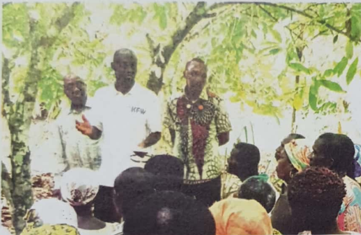
KfW finances via the Outgrower Value Chain Fund (OVCF) projects in agriculture.

The programmes and projects financed mainly involve public sector players in developing countries and emerging economies – from their conception and execution to monitoring their success. Our goal is to help our partner countries fight poverty, maintain peace, protect both the environment and the climate and shape globalisation in an appropriate way.