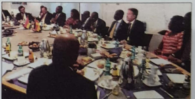
G20 Business Meeting: Ghana's President Nana Akufo-Addo, together with Foreign Minister Shirley Botchwey, Minister of Finance Ken Ofori-Atta and Minister of Education Matthew Prempeh meet German business representatives at a conference organized by the German Chamber of commerce and Industry and by SAFRI - June 2017