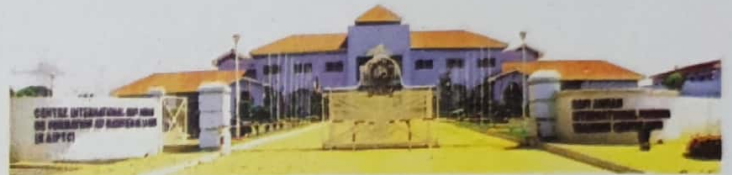
Entrance of the KA IPTC

Germany - through the Federal Foreign Office, the Federal Ministry of the Interior, the Federal Ministry for Economic Cooperation and Development and the Federal Ministry of Defence - has supported the KA IPTC from the very beginning, with up to 30 million euros in total und up to 3.6 million euros for 2017 alone.