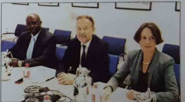
Press conference on results of G20 Afr Conf in Berlin: German Embassy hosts a press conference with Heads of World Bank Ghana and IMF Ghana on the results of the G20 Africa Conference in Berlin – June 2017