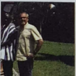
ject in Upper East Region: ast Region of Ghana by the ra