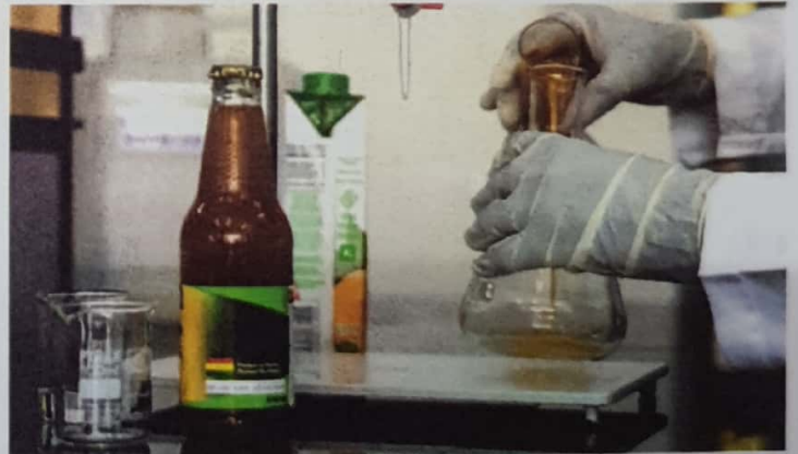
Analysis of Mango Juice by the Ghana Standards Authority

PTB's bilateral collaboration with Ghana started in 2005. As part of the German Development Cooperation, two ongoing projects aim at increasing agricultural production through development and implementation of quality standards along different value chains. They are implemented in cooperation with Ghanaian partner institutions like the Ghana Standards Authority (GSA).