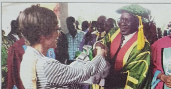
Donation science equipment to KNUST: Donation of a scientific instrument to the Germany alumni and their colleagues at KNUST in Kumasi – July 2017