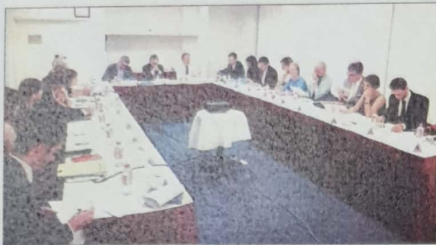
Youth in Africa Conference: Regional conference on "Youth in Africa" organized by the German Embassy in Accra – January 2017