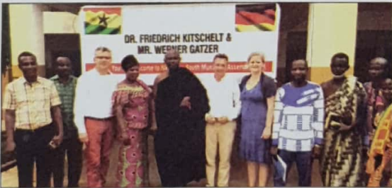
Visit of German Deputy Ministers Kitschelt and Gatzert: Visit of Deputy Minister Dr. Friedrich Kitschelt, Federal Ministry for Economic Cooperation and Development, and Deputy Minister Werner Gatzert, Federal Ministry of Finance, to follow up on Compacts with Africa and Reform-Partnership initiative - July 2017