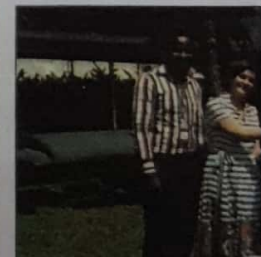
Financial support to irriga Financial support to an irrigation projec NCO TEERE – May 2017