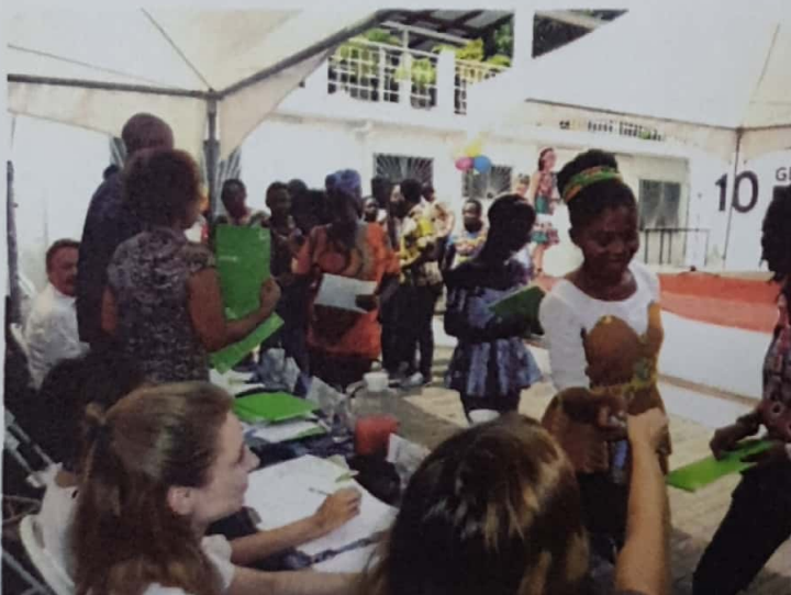
10th National German Cultural Festival at the Goethe-Institut

As a centre for learning and interaction open to the public, the Goethe-Institut offers a library, which is well equipped with books, movies, music and self-teaching materials.