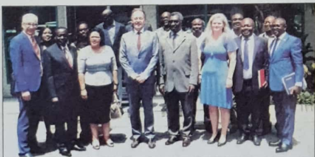
E-Waste: Launch of German Ghanaian 25 Mio Euro E-waste project – March 2017