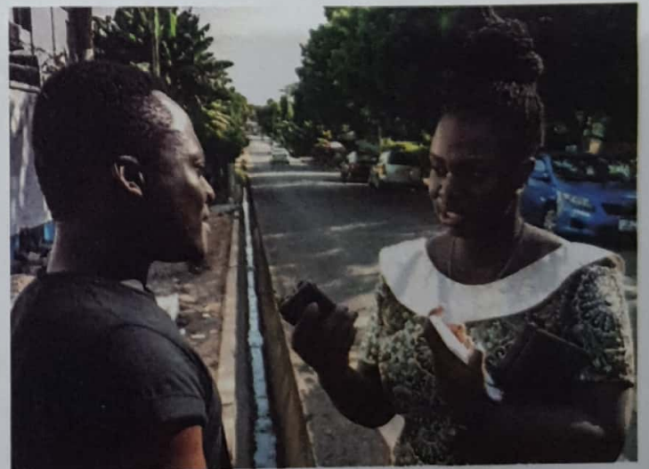
Young journalists trained by the DW Akademie reporting on the streets in Accra

All projects are funded by Germany's Federal Ministry for Economic Cooperation and Development.