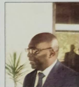
German business commu Vice President Dr. Bawumia and Cerr launch of regular meetings between I German business community – March