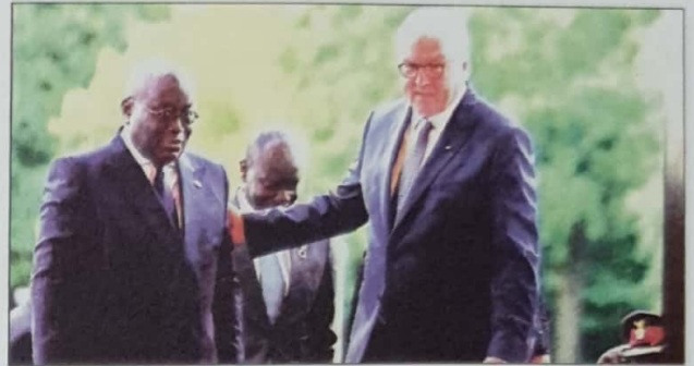
G20 Africa Conference: German Federal President Frank-Walter Steinmeier greets Ghana's president Nana Addo Dankwa Akufo-Addo during a reception at the end of the G20 Africa Partnership Conference in Berlin - June 2017