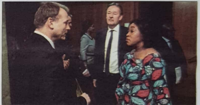
G20 Africa Conference: Ghana's foreign minister Shirley Botchwey and German Ambassador Christoph Retzlaff at the Foreign Office in Berlin – June 2017