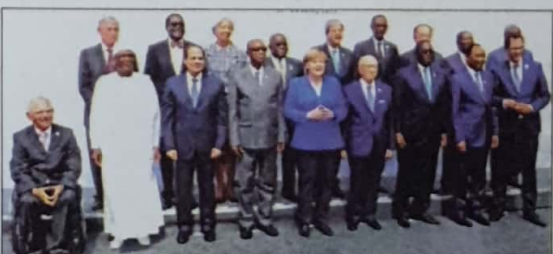
G20 Africa Conference: The German Chancellor Angela Merkel with the President of Ghana Nana Akufo-Addo and Presidents of other African countries and stakeholders at the G20 Africa Partnership Conference in Berlin - June 2017