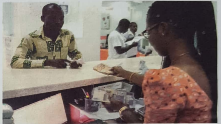
DEG invests in financial institutions, which in turn provide capital

For 55 years DEG has been a reliable partner to private-sector enterprises operating in developing and emerging-market countries. DEG invests in profitable projects that contribute to sustainable development in all sectors of the economy in Ghana, from agribusiness to infrastructure and manufacturing to services. The financial sector is a further focus in order to facilitate reliable access to investment capital locally.