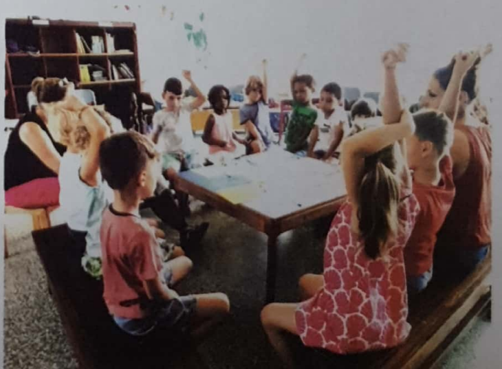
Method Training at the GSIS

Our work in school is based on the quality framework for German Schools Abroad, the Thuringia curriculum and the Cambridge Program. The social background and the West African symbols inspire us in living together and learning in the international school community.