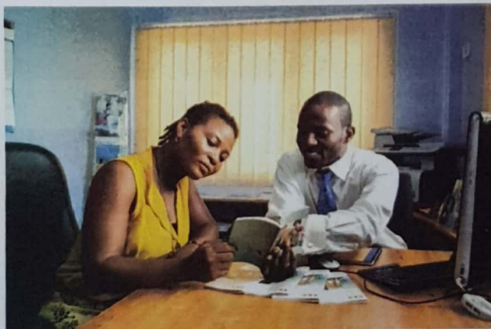
Consultation on "Studying in Germany"

The information Center is located at the Goethe-Institut Accra, next to Nafti, East Cantonments.