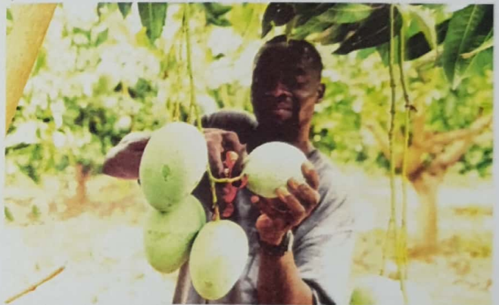
Due to the contribution of GIZ and its partners, 188.621 farmers increased their income between 2010 and 2015

GIZ's work in Ghana is commissioned primarily by the German Federal Ministry for Economic Cooperation and Development, but we also implement projects with the support of other German ministries, European Union institutions, governments of other countries and the private sector.