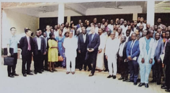
Conference with our partner organizations "Institute of Green Growth Solutions", Special Guest of Honour: Vice-President Mahamudu Bawumia

The Foundation was established in Ghana 1966; currently KAS seeks to promote democratic and economical processes through activities and programs with its partners from Civil Society Organizations, Political Parties and Government Institutions.