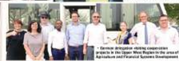
• German delegation visiting cooperation projects in the Upper West Region in the area of Agriculture and Financial Systems Development