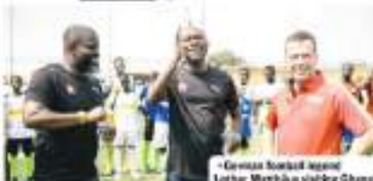
• German football legend Lothar Matthäus visiting Ghana