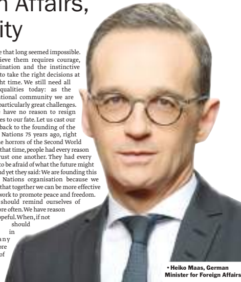
• Heiko Maas, German Minister for Foreign Affairs

We should remind ourselves of that more often. We have reason to be hopeful. When, if not today, should people in Germany be more aware of that