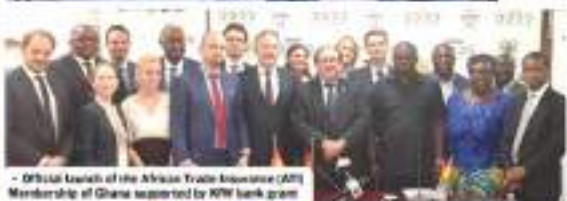
• Official launch of the African Trade Insurance (ATI) Membership of Ghana supported by KfW bank grant