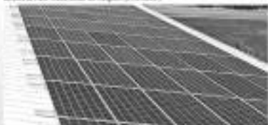
REAVIA Flat Track Solar 40 Kwpm (PTC-400P)

REAVIA Ghana Asset Ltd... P.O. Box 271, 402 Limankoma Road, Accra... Phone: +233 (0) 302 980 1100... Email: info@redavia.com, www.redavia.com