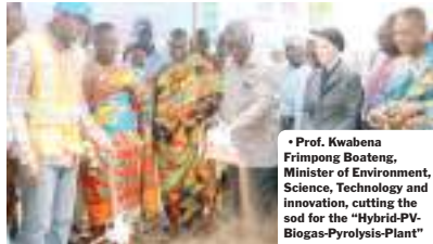
• Prof. Kwabena Frimpong Boateng, Minister of Environment, Science, Technology and Innovation, cutting the sod for the "Hybrid-PV-Biogas-Pyrolysis-Plant"

attended a kick-off meeting in Accra regarding the construction of a 400-kilowatt (KW) hybrid power plant at Atwima Nwabigiya in the Ashanti Region.