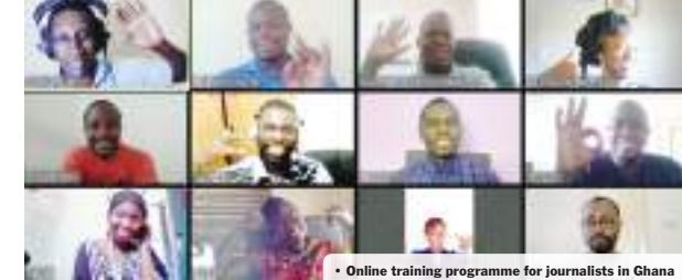
• Online training programme for journalists in Ghana

Since the outbreak of COVID-19, DW Akademie offers many of the teaching programs online.