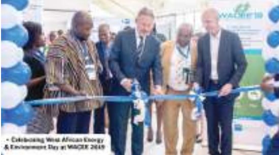
• Celebrating West African Energy & Environment Day at WACER 2019