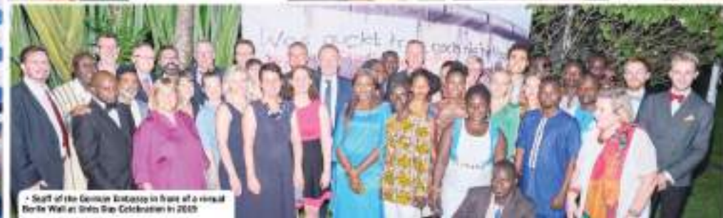
• Staff of the German Embassy in front of a revised Berlin Wall at 50th Day Celebration in 2019