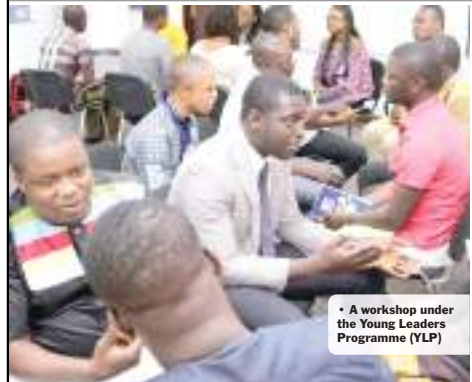
• A workshop under the Young Leaders Programme (YLP)

SPARKASSENSTIFTUNG works to strengthen the local Credit Unions (CUs) and Microfinance Institutions (MFIs) in Ghana by enhancing financial independence and reducing poverty of the economically disadvantaged. It provides support and carries out training programmes. Sparkassenstiftung in partnership with Jireh Microfinance marked the