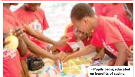
• Pupils being educated on benefits of saving