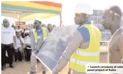
• Launch ceremony of solar panel project at Kaleo

As the project is the first of its kind in the