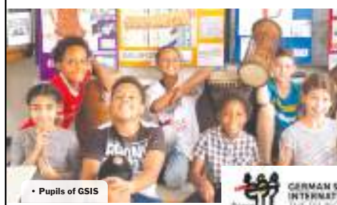
• Pupils of GSIS

THE Friedrich-Ebert-Stiftung Ghana (FES) continues to promote the political participation of women and young Ghanaians through its two flagship programmes, the "Women in Politics Training (WIPT)" and the "Young Leaders' Programme (YLP)". In both lines of work Ghanaian partner organisations play an important role. In the face of the COVID-19 global pandemic, FES Ghana had suspended its 'in-person' activities until June 2020 but with workshops and seminars afterwards. FES makes sure that all its activities are carried out with strict compliance to the COVID-19 protocols and safety guidelines.