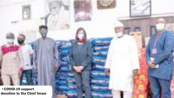
• COVID-19 support donation to the Chief Imam