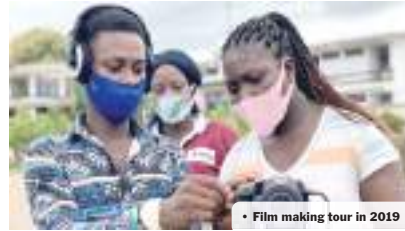
• Film making tour in 2019

The initiatives of YMCA Ghana get financial support from Bread for the World and other partners like the German Federal Ministry for Economic Cooperation and Development (BMZ) and WEITFILME.org