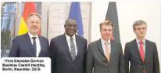
• First Ghanaian German Business Council meeting, Berlin, November 2019