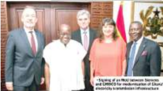
• Signing of an MOU between Sonesac and CIBSD for modernisation of Ghana's electricity transmission infrastructure