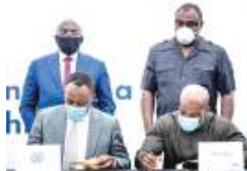
Volkswagen models assembled in Accra are Tiguan, Teramont, Passat, Polo and Amarok. On September 16, 2020,

Universal Motors Limited, a licensed Volkswagen importer since 2005, was awarded the assembly contract. The