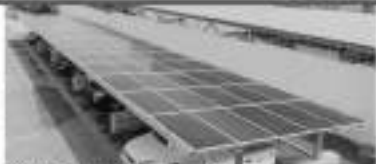
REAVIA Flat Track Solar 40 Kwpm (PTC-400P)