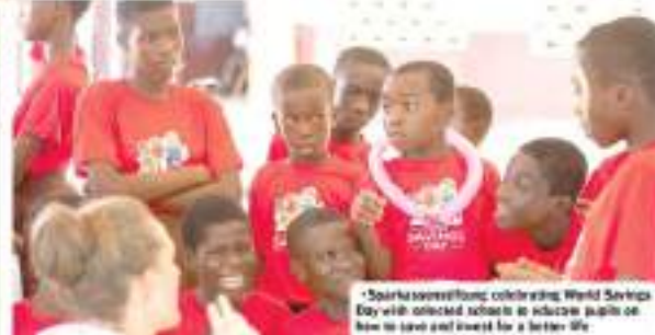
• South-western region celebrating World Savings Day with selected subjects to educate pupils on how to save and invest for a better life