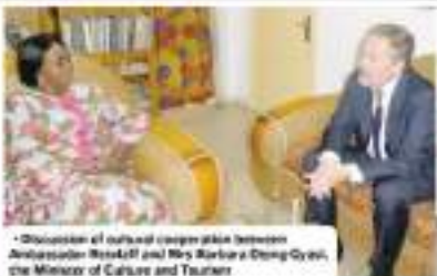
• Discussion of cultural cooperation between Ambassador Resthoff and Mrs Barbara Döring-Gyeli, the Minister of Culture and Tourism