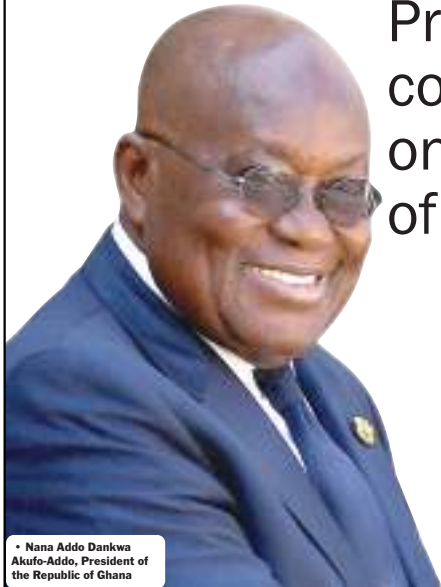
• Nana Addo Dankwa Akufo-Addo, President of the Republic of Ghana