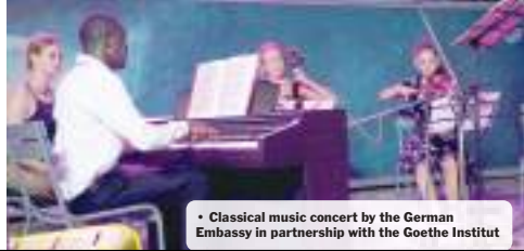
• Classical music concert by the German Embassy in partnership with the Goethe Institut

Its main goals are to promote knowledge of the German language abroad and foster international cultural cooperation as well as providing information about cultural, social and political life in Germany. Due to the COVID-19 pandemic, the GI Accra, unfortunately had to cancel most activities. A limited range of some of the language courses are ran online.