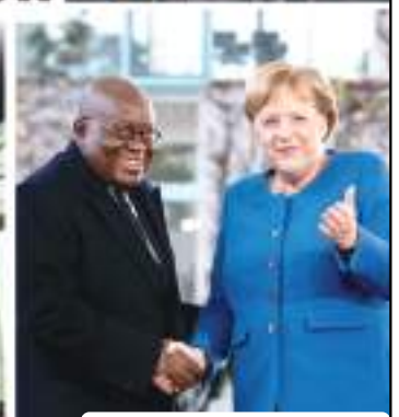
TOP RIGHT: Signing of the Unity Treaty in 1990. BOTTOM RIGHT: Chancellor Angela Merkel welcoming President Nana Addo Dankwa Akufo-Addo to Germany. LEFT: Celebration at the Brandenburg Gate.