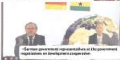
• German government representatives at the government hospital in development cooperation