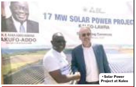
• Solar Power Project at Kaleo