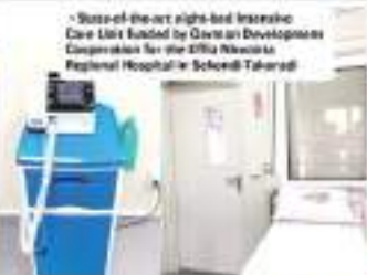
• State-of-the-art eight-bed intensive Care Unit funded by German Development Cooperation for the Effia Nkwanta Regional Hospital in Sekondi-Takoradi