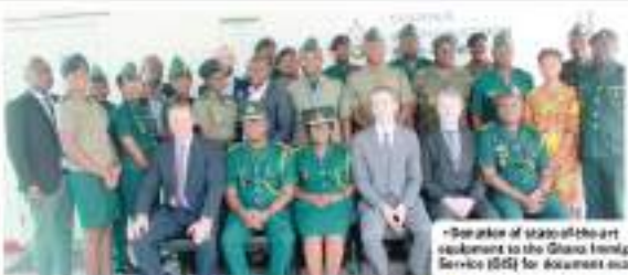
• Donation of state-of-the-art equipment to the Ghana Immigration Service (GIS) for document examination